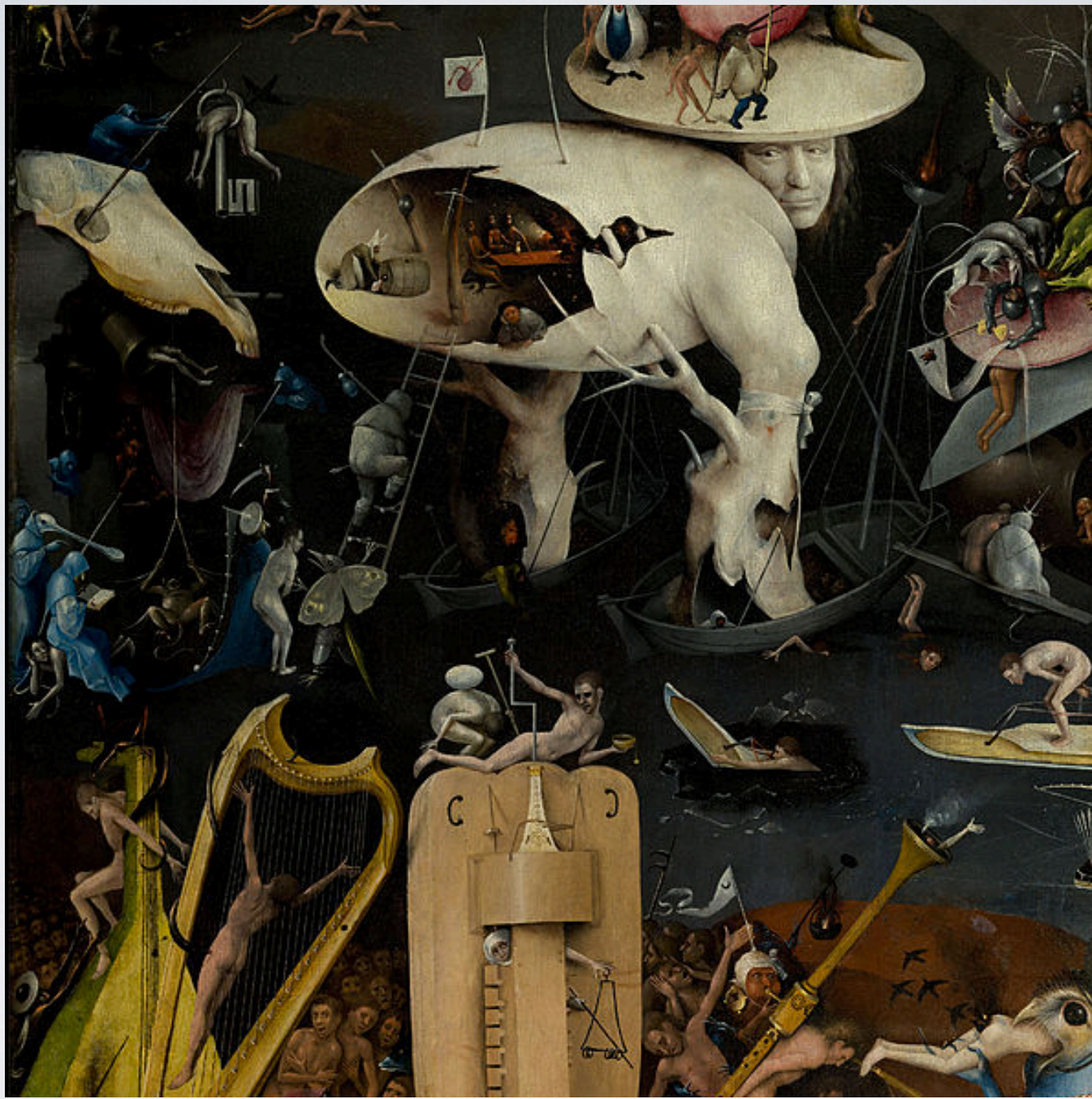
The Garden of Earthly Delights. 1480 public domain

Outline, text, and slides: http://huginn.net/talks/eui-mooc-oa-talk-2013.11